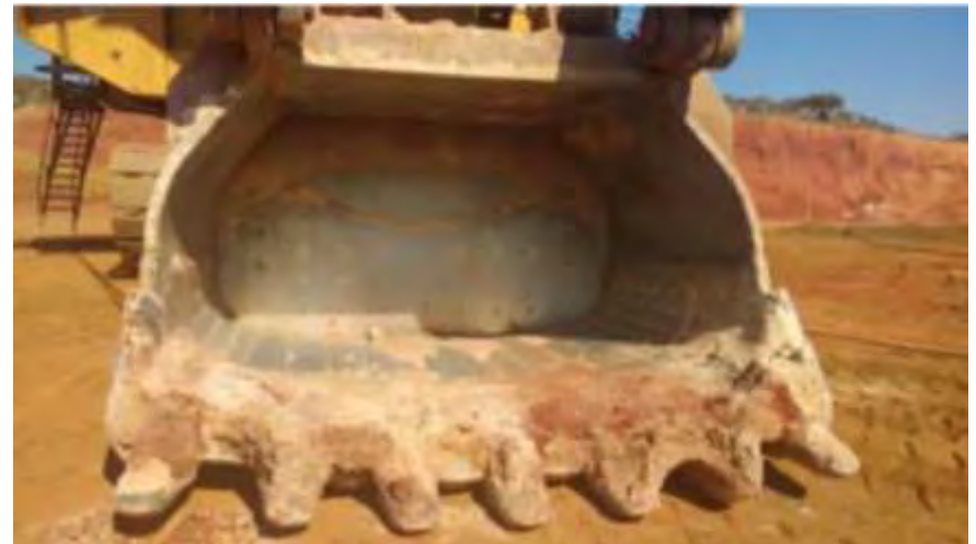
WITH SLIPCOAT MRA™ TREATMENT