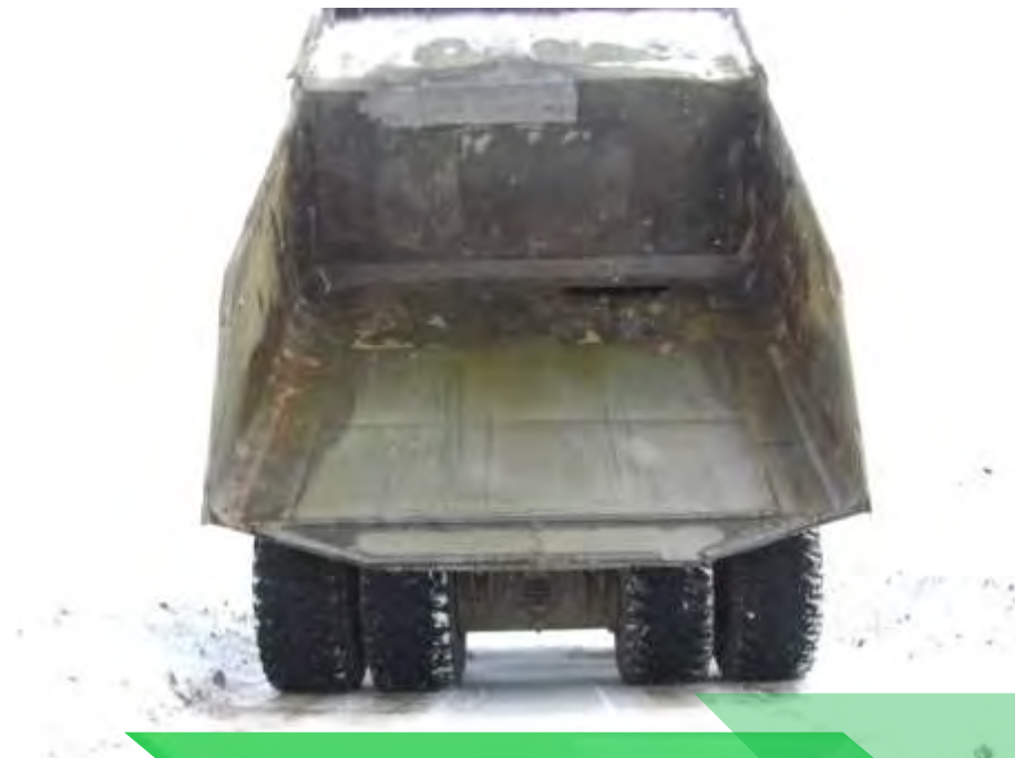
WITH SLIPCOAT MRA™ TREATMENT