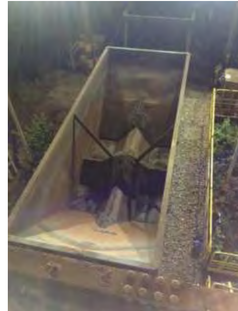
WITH SLIPCOAT MRA™ TREATMENT