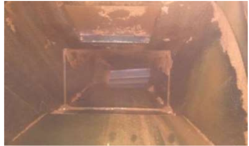
WITH SLIPCOAT MRA™ TREATMENT