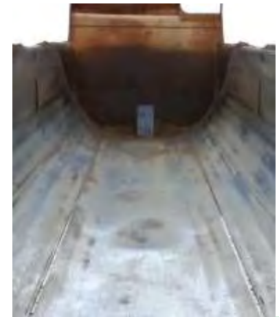
WITH SLIPCOAT MRA™ TREATMENT